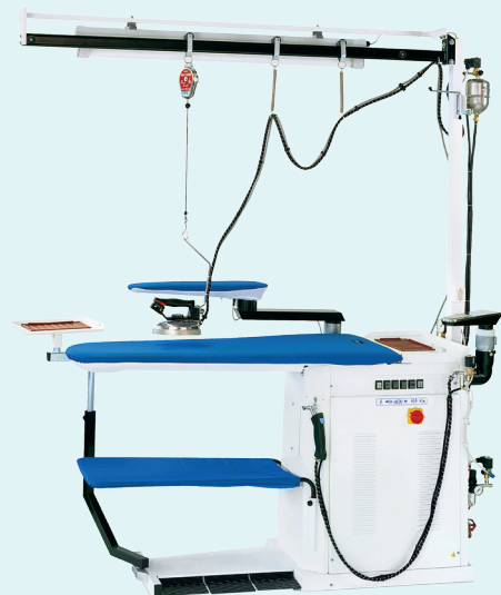
FRA-AVS + TROLLEY